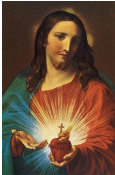
Pompeo Batoni (1767) Sacro cuore di Gesù

Pope Francis ends Chapter II by contemplating on Jesus and his relationship with nature. He highlights the way that Christ used nature to share the messages of God with the disciples. We can ask ourselves: Who loved nature more than Christ? Through his earthly life, Jesus gave it “an attention full of fondness and wonder (97). We can recall the passages within the New Testament, where Jesus controls the wind and sea, demonstrating his intrinsic harmony with nature (98).