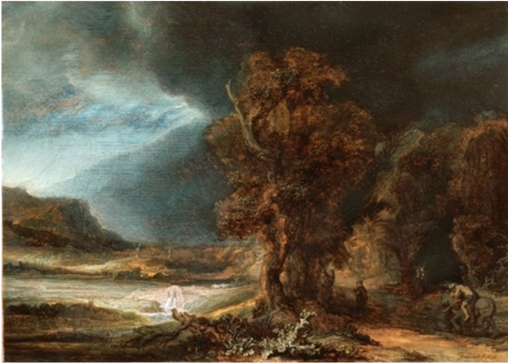
Rembrandt (1638), Landscape with the Good Samaritan

As humans, we all need to recognize that our earth is a “shared inheritance”, and as such, we must have special care for the needs of the poor. God created each of us equally, and as such, one of us is not favored over another. This is crucial for us to begin to break the inequalities that exist within our earthly secular society.