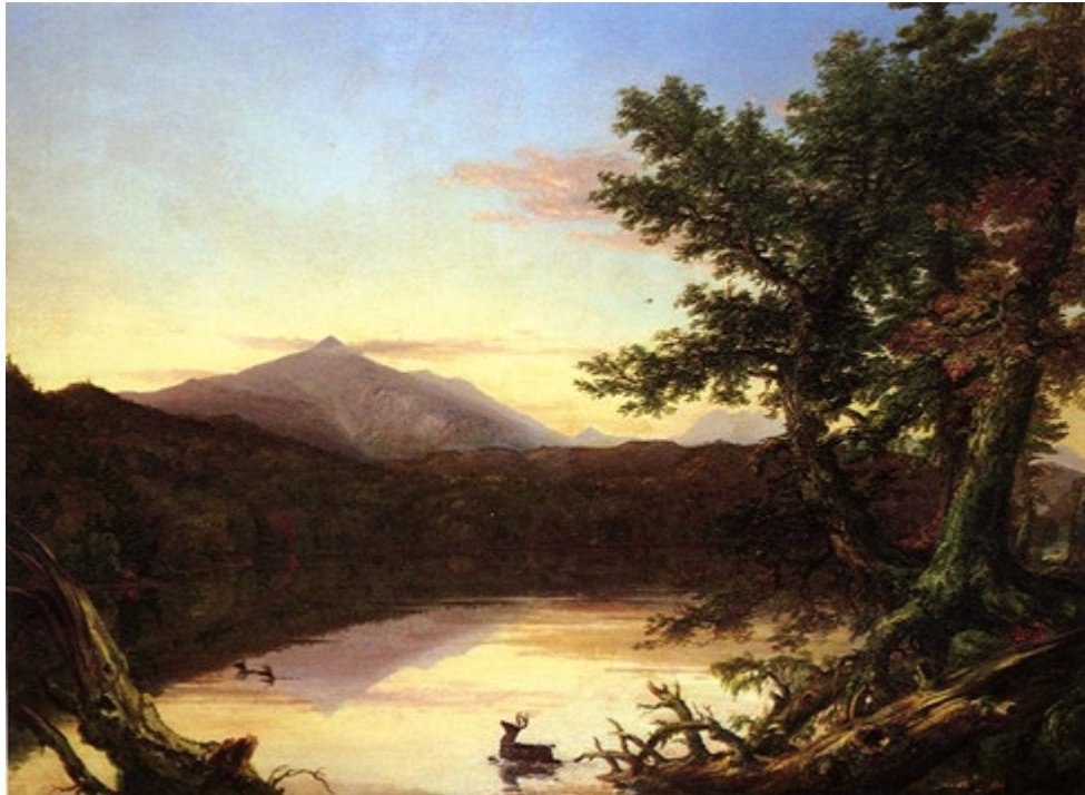
Thomas Cole (1838-1840) Schroon Lake

Within all of creation, we can see a message of God's love for us and feel His "caress" (84). Look outside your window--what do you see? All of us can point out a beautiful variety of plants and animals within creation. The beauty of variety within creation is the demonstration that God cannot be represented fully by one thing. Therefore, each plant and creature, like pieces of a puzzle help to reveal a part of His revelation and help us to contemplate the entirety of His plan for us (86).